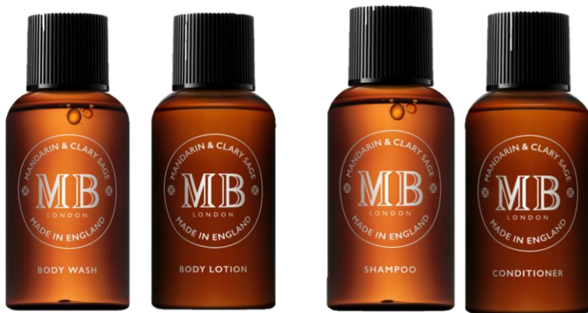
HAIR & BODY Available in 30ml and 50ml