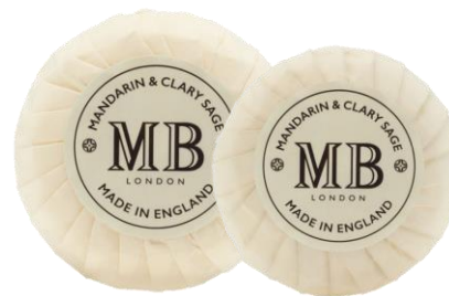
SOAP Available in 30g and 50g